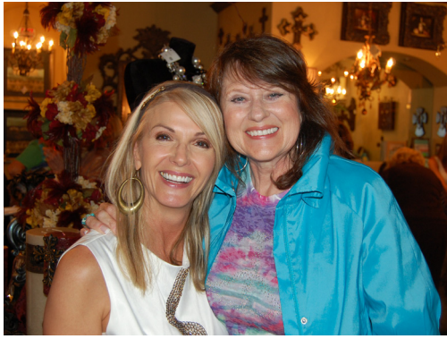
That's Haute hosted The Arts League's Drink 'N Drop Party on Thursday, August 12.