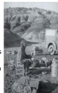
O'Keeffe's connection to the American West and her reputation at the forefront of American Modernism are essential to the premise of this exhibition and pertinent to her induction into the National Cowgirl Hall of Fame. She identified herself with the ideals of the West—rugged individuality, fierce courage and a quest for the untamed. Nowhere is this more evident than through her arduous camping trips to paint the landscape of northern New Mexico, a place she romantically referred to as "the far away."