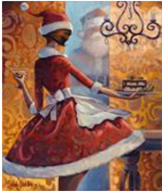
Artwork used with permission of Trish