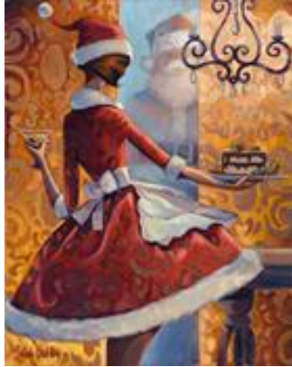
Artwork used with permission of Trish Biddle